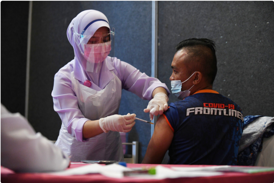
A frontliner receives the Pfizer BioNTech Covid-19 vaccine at the Kuantan Vaccination Centre at Dewan Jubli Perak Sultan Ahmad Shah in Kuantan, February 26, 2021.

Subscribe to our Telegram channel for the latest updates on news you need to know.